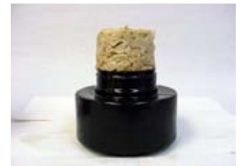
Individual pellet capsules after 50,000 miles of use meld into a single, gelatinous clod blocking the flow of coolant through the filter.

Penray Need-Release® has over 500 billion of miles of service behind it, proving that our cooling system programs offer maximum protection for the life of the engine. The Need-Release® senses the condition of the coolant and releases the proper chemical additives only when needed.