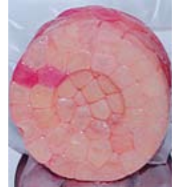
Individual Pellet Capsules after 50,000 miles of use.

In ASTM testing, at 50,000 miles all of the separate, individual pellet-shaped capsules melded into a single, solid, gelatinous clod. (See inset at right) The clod completely blocked the flow of coolant through the filter, resisting even the full pressure produced by the system's water pump. From 50,000 miles and on there are no more chemicals to protect the coolant, rendering the filter completely useless.