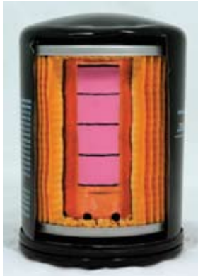
Penray Need-Release® Technology

The Penray Need-Release® Extended Service Interval filter contains patented technology that delivers chemical additives to your system exactly when you NEED them. Dump truck, city delivery, long-range hauler or anything in between, it doesn't matter. The filter monitors the coolant and keeps the protection levels stable. The corrosivity of the coolant eats a tiny hole in the patented membrane and dissolves the coolant additive into the system. No messy globs to stop the flow of coolant or prevent the additive from entering the system. The Penray Need-Release offers maximum protection for the life of the engine.