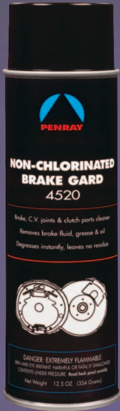
4520 Non-Chlorinated Brake Cleaner High V.O.C.